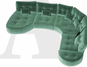
End footstool "PS"