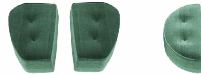
Footstools "PT1", "PT2" and "PS"