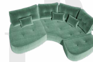
End footstool "PT1"